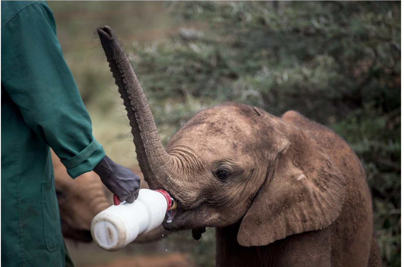
David Sheldrick Wildlife Trust elephant orphanage