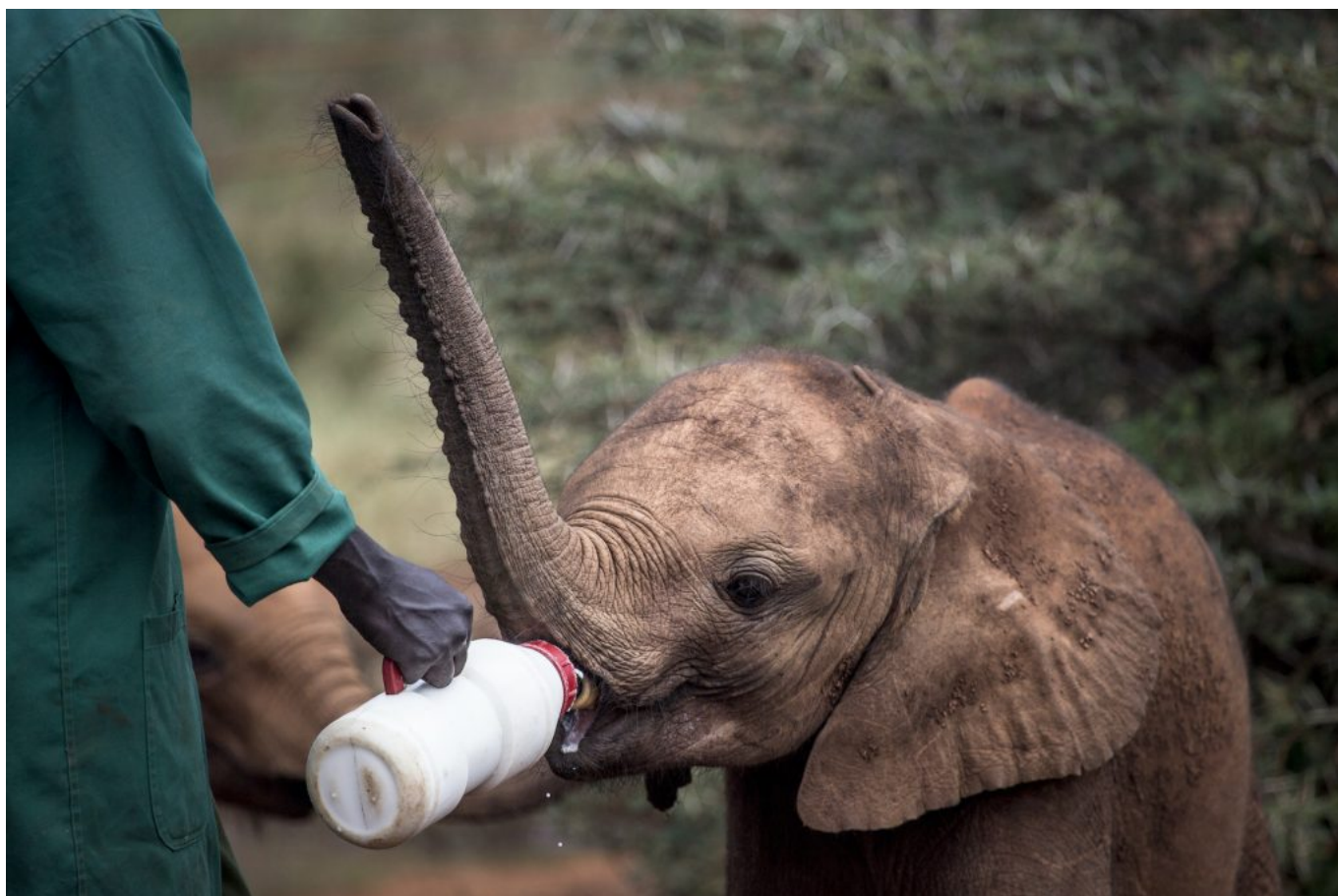
David Sheldrick Wildlife Trust elephant orphanage