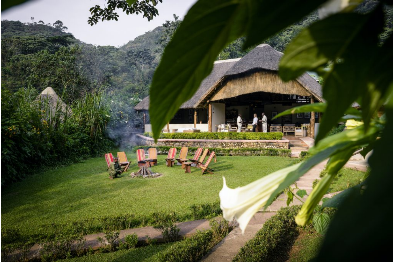
Uganda, Sanctuary Gorilla Forest Camp