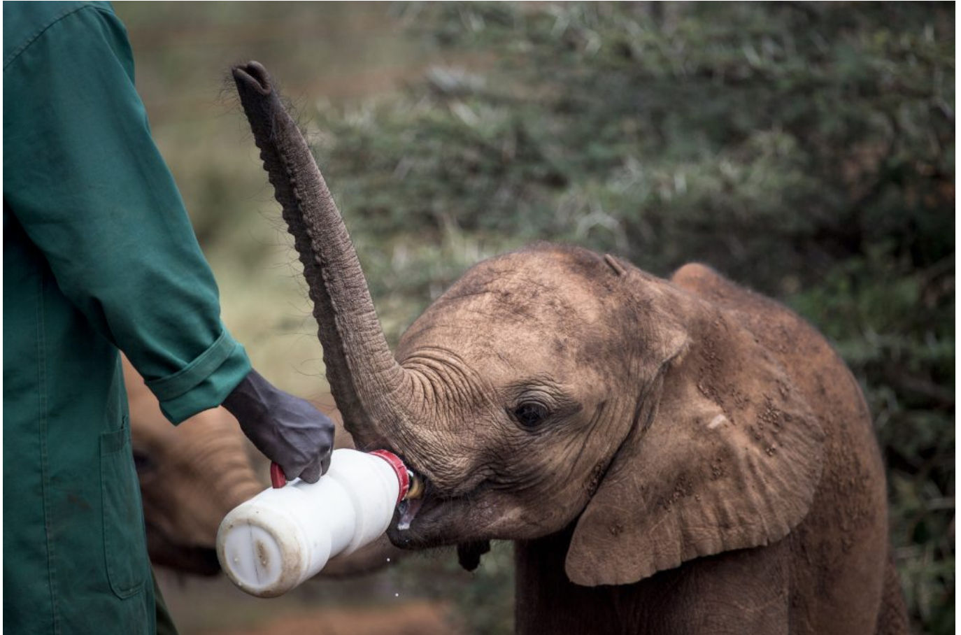
David Sheldrick Wildlife Trust elephant orphanage