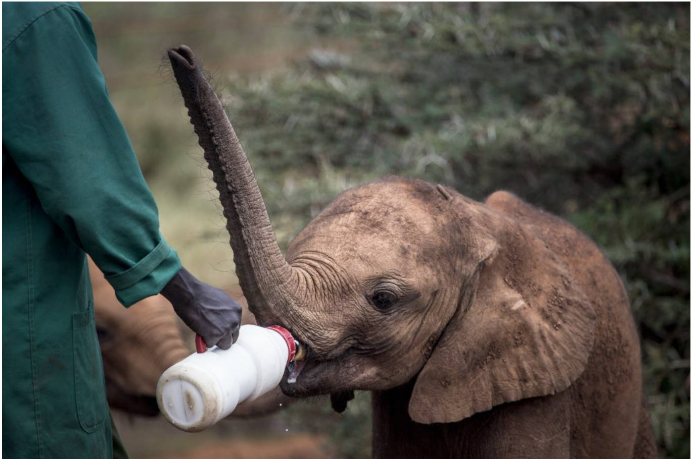
David Sheldrick Wildlife Trust elephant orphanage