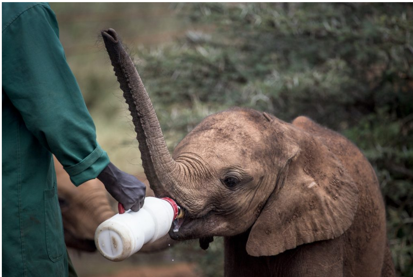
David Sheldrick Wildlife Trust elephant orphanage