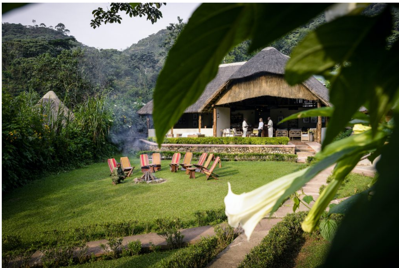
Uganda, Sanctuary Gorilla Forest Camp