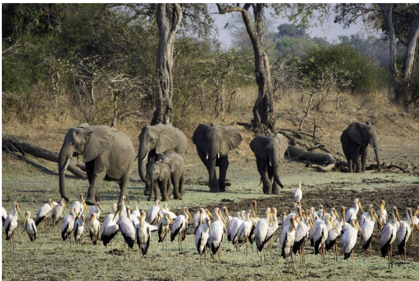
Elies and yellow billed storks

Elephant, tsessebe, reedbuck, oribi and sitatunga have also adapted to this area, and can be found in large numbers, and don't forget to look in the lagoons and rivers where hippos can be seen and crocodiles skulk in the reed beds.