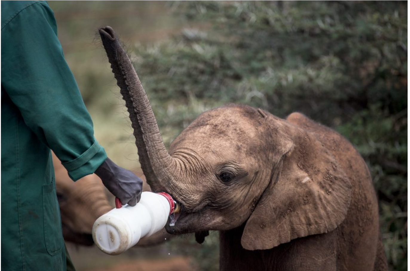
David Sheldrick Wildlife Trust elephant orphanage