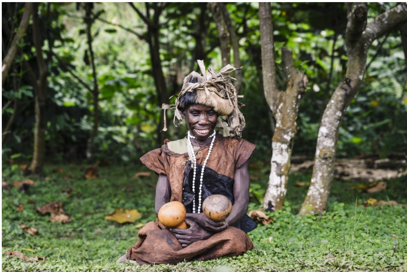
Uganda, Bwindi Impenetrable Forest, Gorilla Forest Camp