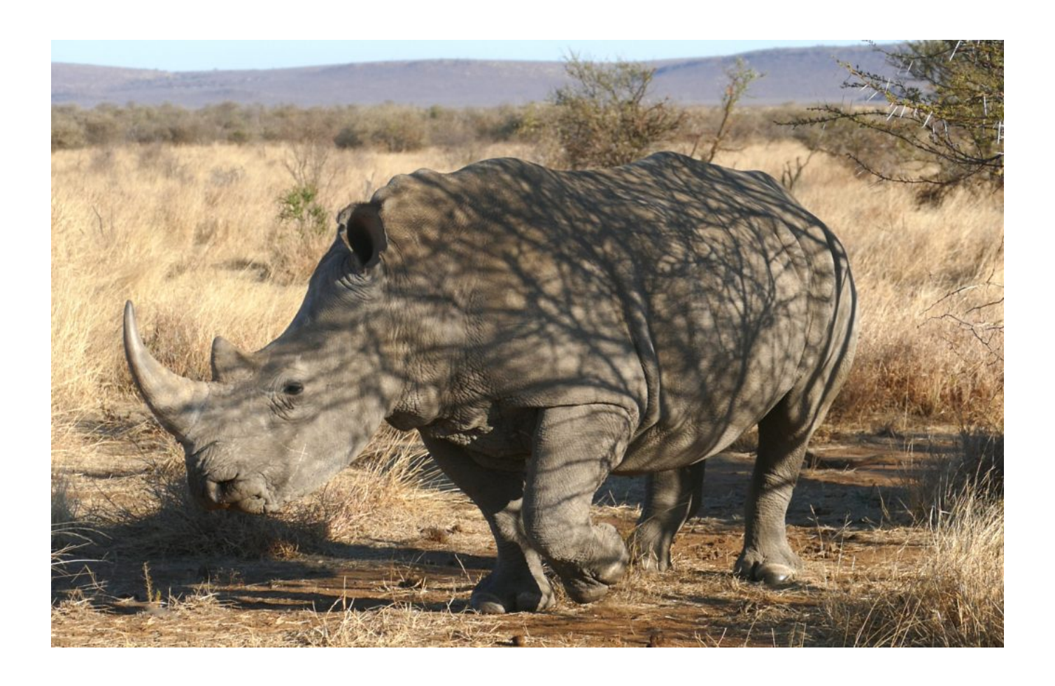
Whispers of the wild

In the middle of an extensive rich acacia woodland lies one of <u>Uganda's</u> most spectacular and breathtaking, the Lake Mburo National Park.