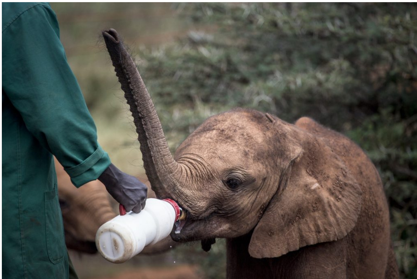
David Sheldrick Wildlife Trust lephant orphanage